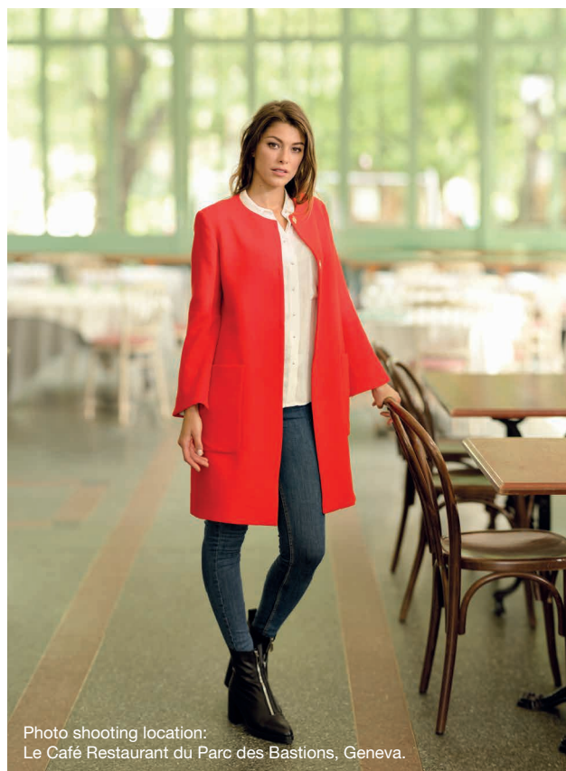
Photo shooting location: Le Café Restaurant du Parc des Bastions, Geneva.

In addition, the version 570α includes an alphabet with lower and upper case characters, numbers and symbols. The memory function of this model enables you to create personal and unique stitch combinations and to program text and names.